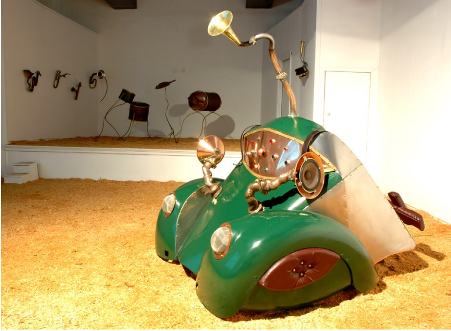
Jane Venis, The Snurglaphone , from Freaquent Viewing , interactive exhibition at the Seque Gallery, September 2006 (photograph: the author).