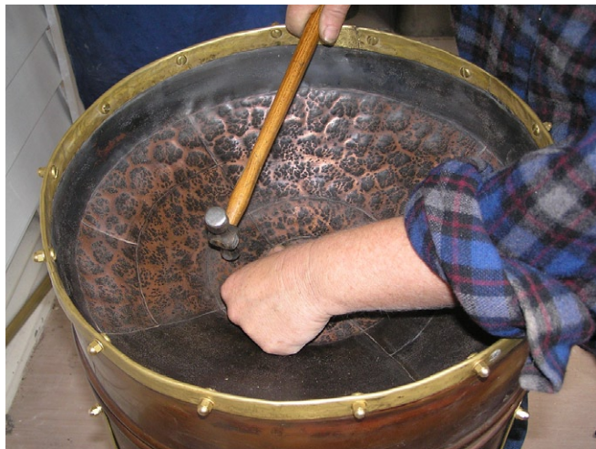
Jane Venis, 2006, copper and brass 'steel' drum made from recycled hot water cylinders, tuned by beating with a hammer (photograph: the author).