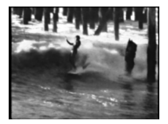
"'Soul Arch' at the T", still frame from Dogtown and Z-boys