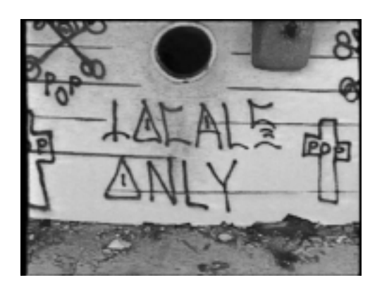
"Pacific Ocean Pier graffiti", still frame from Dogtown and Z-boys of a photo by Craig Stecyk

regulated expenditures of Pacific Ocean Park ultimately reinforced a bourgeois ethics, the gratuitous expenditure of the Dogtown crew inscribed an ethics of alienation and exile. Unlike the rollercoaster, the wave is an unregulated movement and an end in itself. It is good for nothing, and the act of riding each wave is an expression of expenditure that is always singular and irrecuperable. It is thus that movements of expenditure become performances of sovereignty, released from the scheme of utility but simultaneously connected to place. For the Dogtown crew, the refuse of Pacific Ocean Park became their exclusive right to spend — an exclusivity enforced by fierce localism and violence. This double gesture of reckless expenditure and protective jealousy with regards to territory underscores the paradoxical "crooked will" that Georges Bataille locates in the more agonistic aspects of expenditure as challenge and contest.