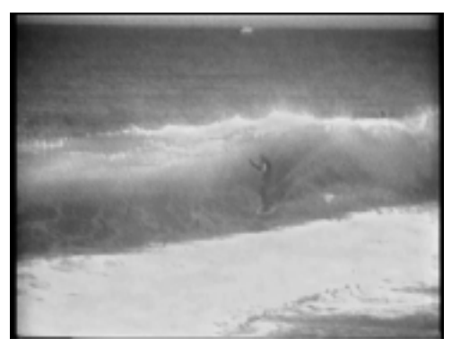
"I am surfing on heroin", still frame from Runman 69