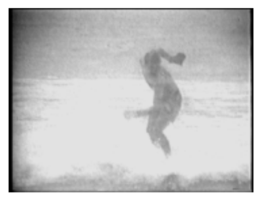
"Pump and spaz and gyrate", still frame from Runman 69

In juxtaposition with the disciplining and professionalisation of surfing there still remained a hard-core, which adopted some of the equipment advances of the 1980s but still conferred prestige through an economy of loss, and which found its anti-heroes outside the surfing mainstream and largely beneath the radar of the surf media. This sensibility found expression during the 1980s in underground surf videos such as Runman, Runman 2: Headbut Party, Runman 69, and Runmental (early 1990s). Shot mostly in and around the Los Angeles area, the videos focused on mostly non-professional surfers in extremely dangerous conditions at semi-secret breaks; on a skateboarder who bombs Sunset Boulevard at 60 miles per hour. running straight through red lights; and on natural disasters, public riots and beach parking lot fights. Runman 69 also ridiculed the type of contest surfing that had become synonymous with the 1980s. The film presents sequences of surfers gyrating their boards spastically in small waves to generate points and taunts them in voice over: "pump and spaz and gyrate, spaz and turn and gyrate, spaz and turn and pump, pump and turn and pump, spaz!" In addition to the degradation of surfing into a grovelling for points (like scrambling for loose change on the sidewalk), the sequence also dwells on the indignity of the pink priority buoy by which the assertion of hierarchy in the water is relegated to a hyperactive paddling race.