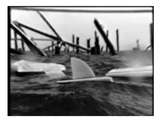
"Broken boards and sunken roller coaster at the T", still frame from Dog Town and Z-boys of a photo by Craig Stecyk

Bataille identifies his paradigm for such types of expenditure in the archaic practices of Potlatch, described originally by the anthropologist Marcel Mauss in his book, The Gift: Forms and Functions of Exchange in Archaic Societies . Mauss details a number of contests among Native American tribes in the north-western United States that revolve around the gratuitous expenditure of valuables. Curiously, many of these examples involve the casting of objects into bodies of water. In one dramatic example, two rival chiefs confront each other across opposite banks of a river and begin to toss valuables into the water in an escalating pattern of destruction that culminates in the reciprocal slaughter of personal slaves. Similar contests have also been described among the Chumash nation (the coastal Native American tribe stretching from San Diego to Northern California) who tossed copper ingots and weapons into the ocean, as well as sending flotillas of canoes to their destruction in the surf. <sup>10</sup> In all of these cases, power and prestige are a measure not of how much one can accumulate, but of how much loss one is capable of sustaining. In isolation, the contest of Potlatch appears completely antithetical to accumulation economies. Yet, considered in general economic terms, its regulated forms indirectly control accumulation by maintaining an embargo on the privilege