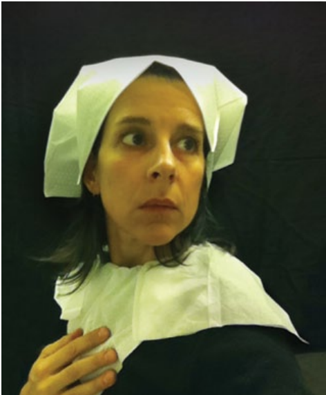
Figure 1. Nina Katchadourian Lavatory Portraits in the Flemish Style (2011). Photograph.

only with a digital camera/phone) inhabit this same space of light-hearted irreverence. Lavatory Portraits in the Flemish Style (figure 1), for example, is a series of photographs which have the artist dressed in the apparent garb of the high bourgeoisie and merchant class found in Flemish portraiture, but the characteristic white ruffs and head-dress are made with disposable hand-towels and other items found on board and photographed with appropriately pious composure in the airplane lavatory. A two channel video work is made in the same style but here devout countenances are corrupted as faces begin to mouth the words to the video's ACDC soundtrack found on the onboard music centre. 5