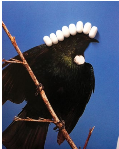
Figure 2. Nina Katchadourian, Tic Tac Tui (2011). Photograph.

of someone skiing upon which she has placed a half eaten airline sandwich in such a way as to look as if the skier is being pursued by a voracious avalanche. The resulting photograph becomes a snack-food sublime. Another group of images plays on the seductions and hocus-pocus of advertising imagery through the selective and idiosyncratic documentation of images of 'pure New Zealand.' The pieces are photographed so that they capture reflective glare from the tourist brochure's glossy paperstock, visually intimating occult emanations, supernatural light coming forth from idealised landscapes, or 'lifestyle' shots of the antipodean bourgeoisie. In another series, Katchadourian adorns images of native New Zealand flora and fauna with candy and other bits and pieces to create an entire ecosystem of exotic creatures. With names like Tic Tac Tui , Fruity Eyed Swallow (male) , and Ornate Sugar Crested Penguin (see figures 2-4) the nature-porn of the inflight magazine is brought down firmly into the sphere of kitsch infotainment (the true genre of touristic imagery), and leads the ironic stance evident throughout the show at least some way down the road of critique.