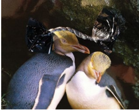
Figure 3. Nina Katchadourian, Fruity Eyed Swallow (male) (2011). Photograph.