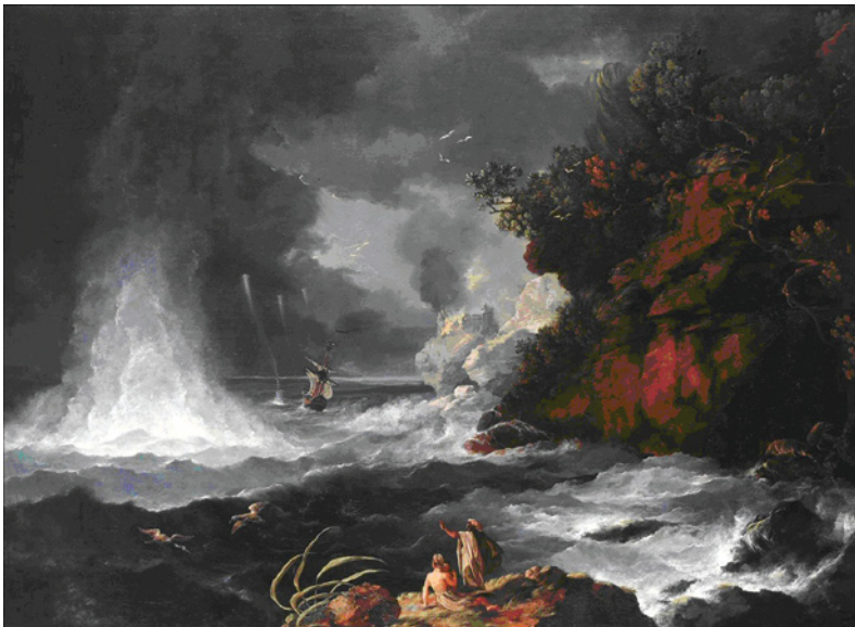
Figure 1: William Hodges, A View of Cape Stephens (New Zealand) in Cook's Straits with Waterspout , 1776. (National Maritime Museum, London. Ministry of Defence Art Collection. Reference #: BHC1906. Image in public domain.)

Beyond the shadow of the ship I watch'd the watersnakes: They mov'd in tracks of shining white; and when they rear'd, the elfish light Fell off in hoary flakes.