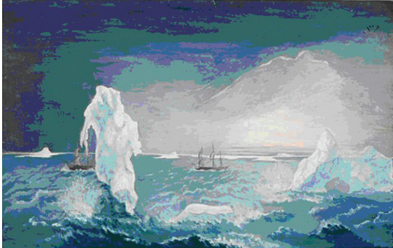
Figure 3: George Forster, Ice Islands with Ice Blink , 1772-73. Mitchell Library, State Library of New South Wales.

Both poem and Forster's picture may be compared with an extract from Cook's journal of the second voyage of 1774: