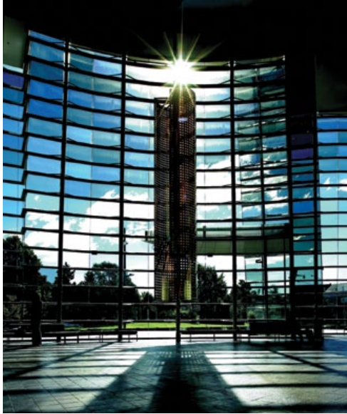
Figure 1. Andrew Drummond, Viewing Device, Counter Rotating (2008-10). Steel, air-control systems, coatings, electroplated aluminium. Collection of the artist. Photographed in Christchurch Art Gallery foyer. Photographer: John Colлие. Reproduced with permission.

There is also a range of related semi-legal issues, perhaps more properly described as ethical, which arise in the treatment of art, including the negotiations and agreements resulting from the now customary iwi and whanau consultations associated with the borrowing, display, labelling and contextualisation of tāonga and traditional portraits of Māori subjects. 3