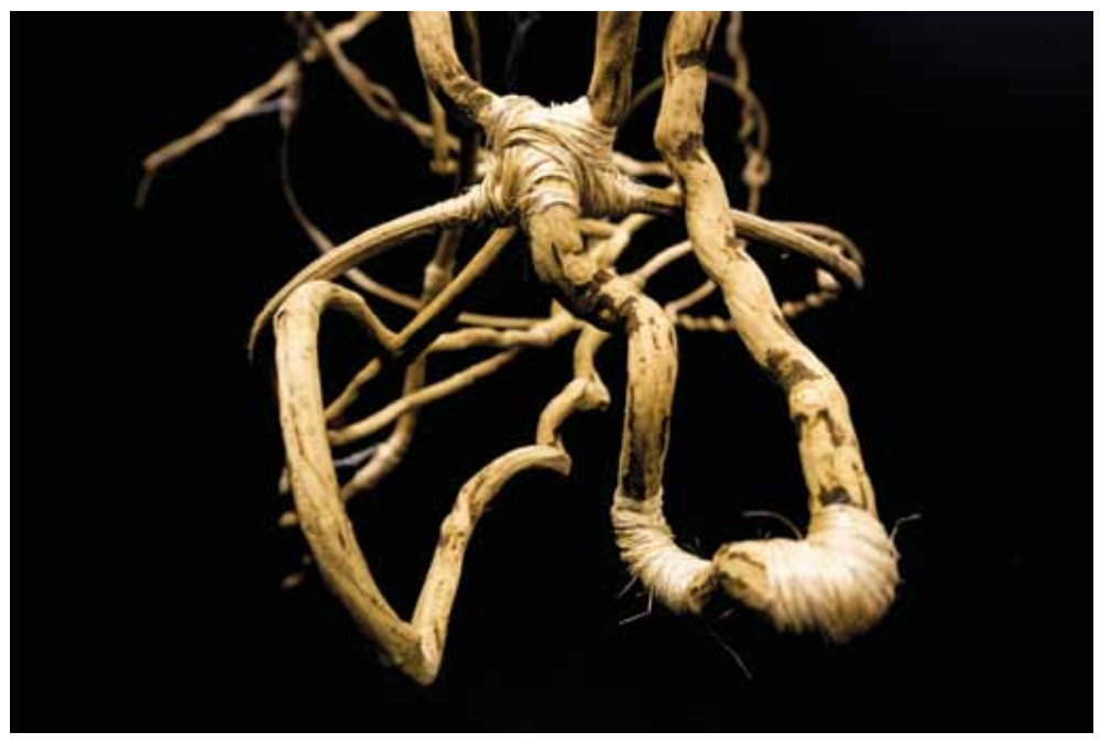
Figure 6. (detail).