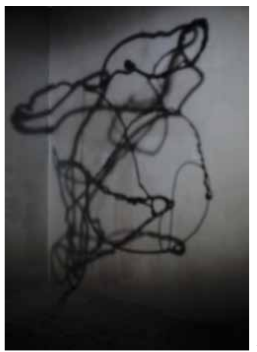
Figure 7. Shadow drawn on wall, cast by the 3-D object /chromosome.