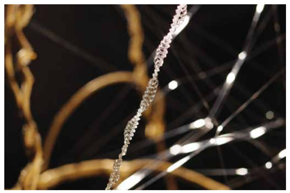
Figure 5. (detail).