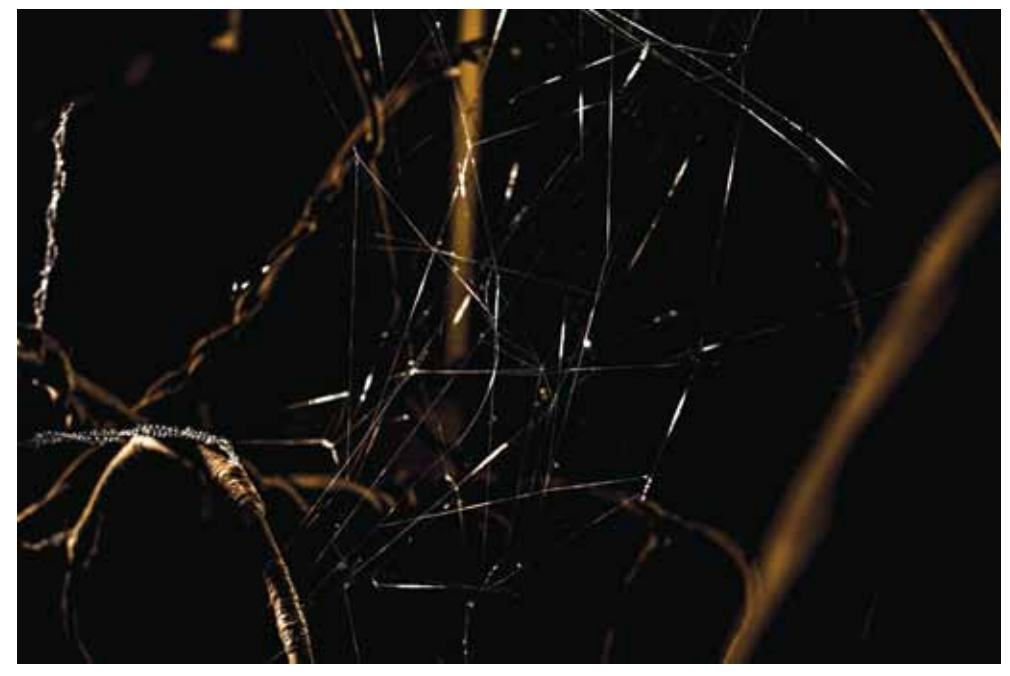
Figure 11. (detail).