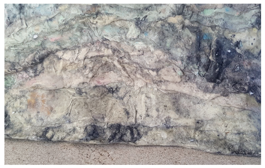
Figure 5. The accreted paper and charcoal still visible on the other side of the object.