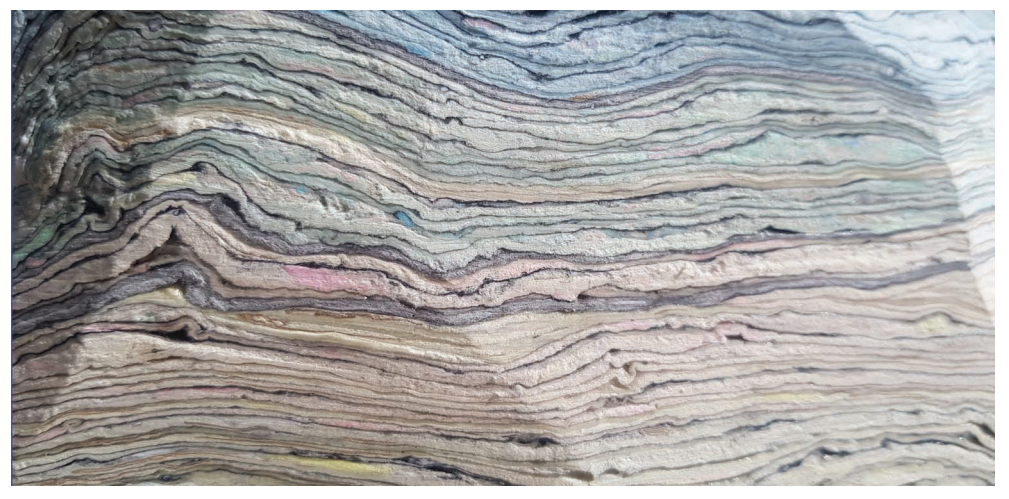
Figure 3. Cross section through the final "accretion" of paper pseudofossils. Paths of travel are visible as folds and bumps in the paper sheets. Photograph: Madison Kelly.

Figure 2. A trace of finch movements through the treeline above the street corner, "fossilized" in pressed charcoal and recycled paper. Photograph: Madison Kelly.