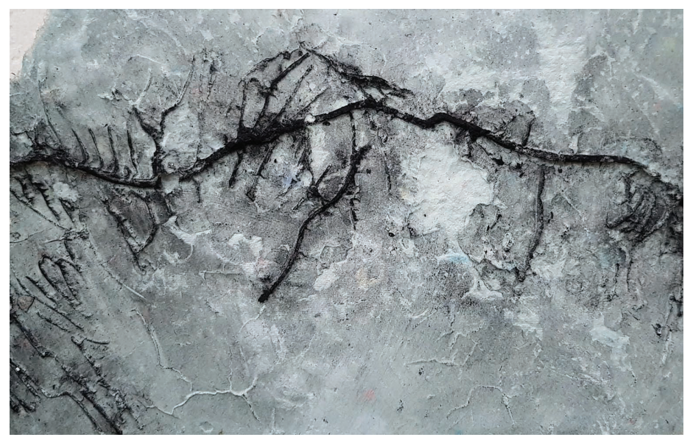
Figure 2. A trace of finch movements through the treeline above the street corner, "fossilized" in pressed charcoal and recycled paper.