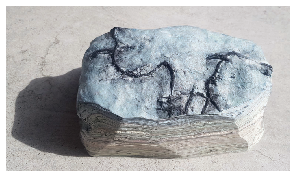
Figure 4. Top-down view of the final accretion, with most recent trace observation still visible at the uppermost layer.