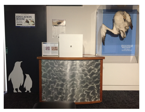
Figure 3. Avian malaria exhibit display at the Royal Albatross Centre public gallery.

With regards to endangered birds, which are already struggling with reproduction, the downward reproductive trend continues to limit their gene pool and their immunity levels to combat malaria disease. Furthermore, although use of insecticides and antimalarial drugs would suppress avian malaria transmission temporarily, it simultaneously encourages adaptation of drug-resistant superbugs in mosquitos and malaria parasites respectively. Hence, New Zealand will require a multiple-prong and innovative approach to manage vector disease transmission in order to conserve its vulnerable native bird species.