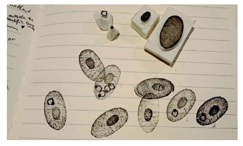
Figure 4. Hoiho under the microscope work in progress, interpretation of Giemsa stain of a thin blood film from a yellow-eyed penguin.

Not a lot is known about how we can control mosquito populations and the illnesses they carry in New Zealand but countries like Australia, with a high risk of human infection, use public awareness as a tool to help limit the spread. In Australia, advice on managing mosquito-spread illnesses is split into two common categories: preventing mosquito bites, and preventing mosquito breeding. There is little we can do to prevent bites in wild bird populations; preventing mosquito breeding is a