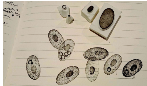
Figure 4. Hoiho under the microscope work in progress, interpretation of Giemsa stain of a thin blood film from a yellow-eyed penguin.

To monitor human diseases spread by mosquitos, Australian scientists use traps to collect samples of adult populations and water samples to look for larvae. In New Zealand additional information is gathered by testing blood samples from infected populations and performing manual counts of the avian malaria parasites in a blood smear. This takes place under a microscope and is time consuming and labour intensive.