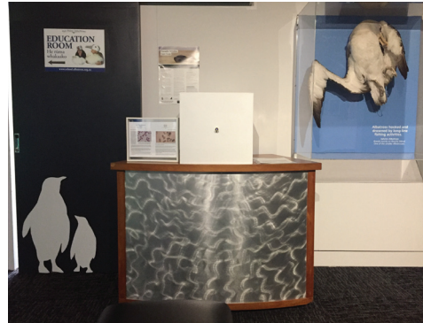
Figure 3. Avian malaria exhibit display at the Royal Albatross Centre public gallery.

With regards to endangered birds, which are already struggling with reproduction, the downward reproductive trend continues to limit their gene pool and their immunity levels to combat malaria disease. Furthermore, although use of insecticides and anti-malarial drugs would suppress avian malaria transmission temporarily, it simultaneously encourages adaptation of drug-resistant superbugs in mosquitos and malaria parasites respectively. Hence, New Zealand will require a multiple-prong and innovative approach to manage vector disease transmission in order to conserve its vulnerable native bird species.