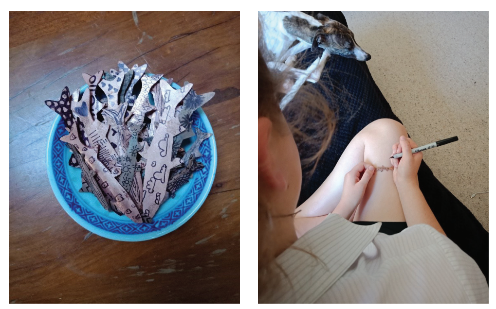
Figure 1. "Grayling Design Workshop" participant decorating the individual fish in preparation for etching.

The individual fish brooches had their own unique markings and patterns, just like the morphological variations seen within the species. Each was designed to be worn as an individual piece, as well as forming a component of the larger artwork. The brooches were etched using the designs drawn by individual school-aged participants in a "Grayling Design Workshop" I conducted during school holidays (Figure 1). As part of the workshop, the participants learnt about the grayling's story and about the importance of preserving our native species.