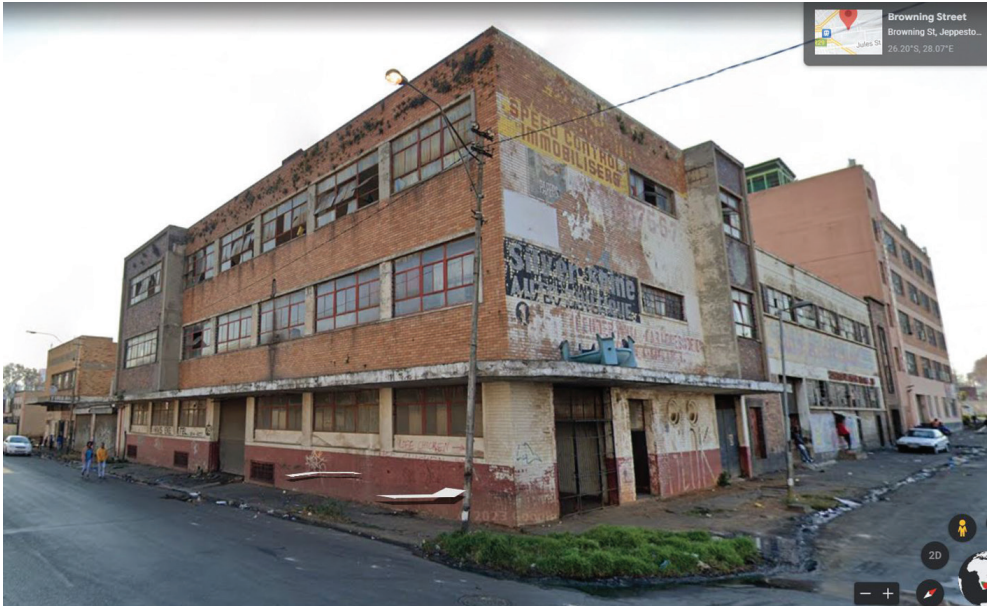
Figure 10. Gloomy ‘monster’ building. This factory building on the corner of Browning and Wolhuter Streets, Jeppetown, is visibly damp, with vegetation growing out of the brickwork. An open side door hints that people may be living in this horrible place.