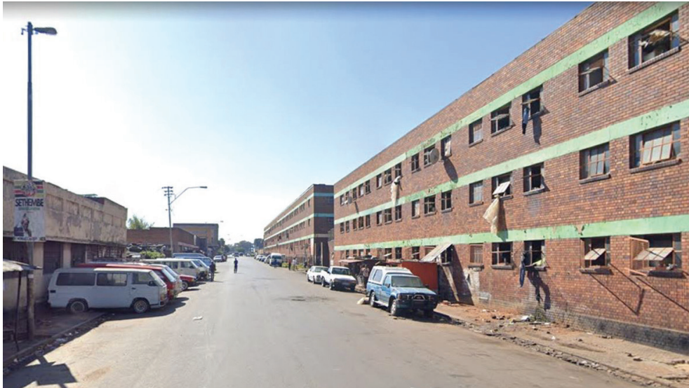
Figure 6. View of the prison-like Wolhuter Men's Hostel, looking east along Wolhuter Street. Several thousand men live in this hostel.