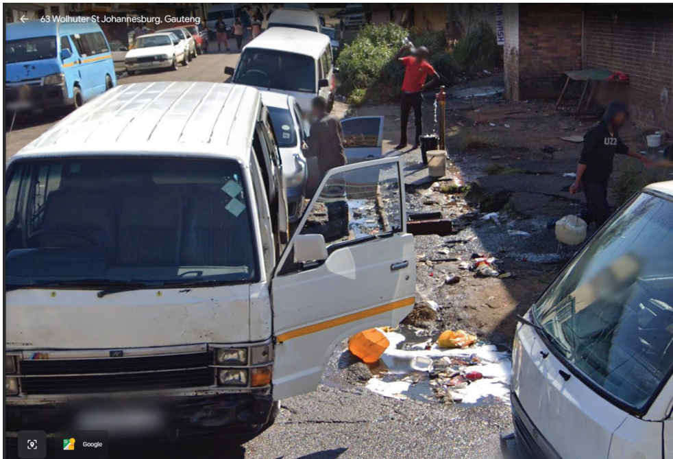
Figure 7. Taxi washing in Ford Street, opposite Wolhuter Men's Hostel. The water main has been illegally connected to a tap, resulting in 'water theft.'