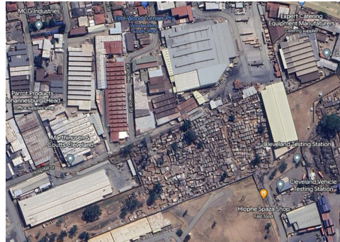
Figure 4. The Jumpers informal settlement, Cleveland, located 'in-between' industrial buildings on the site of the Jumpers Deep Gold Mine Ltd, East Incline shaft, now defunct.