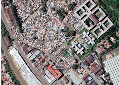
Figure 3. Google Earth remote sensing view of the Denver Men's Hostel (top right) and associated informal settlement, as well as nearby industrial buildings. All this land is zoned Industrial 1, yet now has an informal residential component.

The most visible aspect of the study areas was the way that existing decrepit factory and warehouse buildings have been put to use for residential purposes, even though they remain zoned for industrial use. Also present are informal settlements composed of self-built shacks on public open spaces and road pavements, and the proliferation of backyard shacks of various quality in the yards of formal buildings. Informal shack settlements have also sprung up around the former all-male hostels associated with gold mining to provide accommodation for the men's families (Figure 3). The Junkers informal settlement in Cleveland (Figure 4) is notorious for violence, and church volunteers will not enter this area (informal comment from church volunteer).