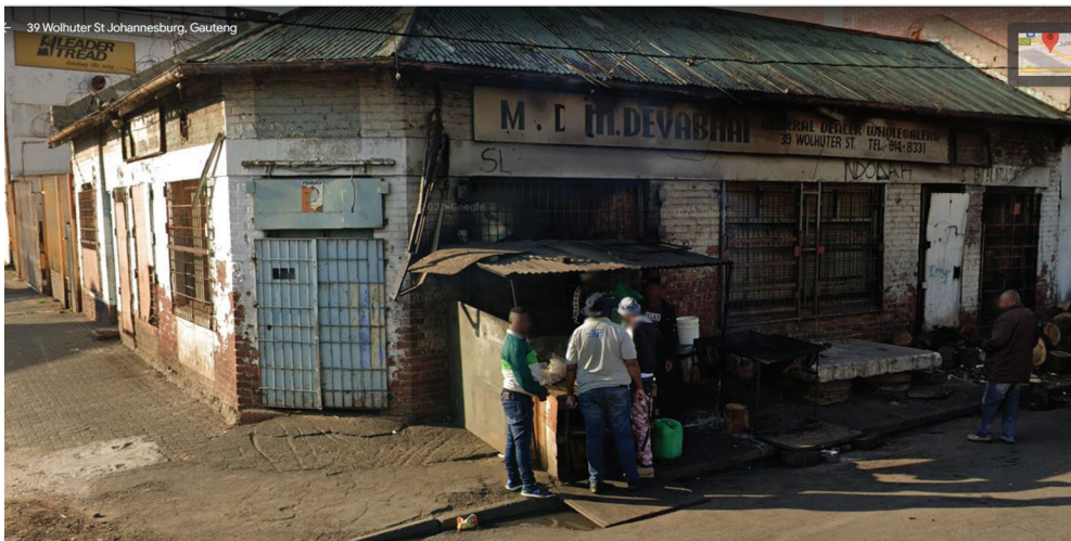
Figure 2. Informal street eatery, corner of Janie and Wolhuter Streets, Jeppestown.

The consequences for safety and security, crime and mental health of living in inadequate housing are well known. 23 There is a close relationship between poverty, social stress and mental health problems and, in some cities like Glasgow, where the issue has been studied in depth, there are a host of indicators that link poverty and poor mental health, including lower mental well-being and reduced life satisfaction, and higher rates of common mental health problems, higher prescribing figures for anxiety, depression and psychosis and greater numbers of hospital admissions for psychiatric conditions. 24 In South Africa, the same health outcomes of poverty exist, but are less well recognised. 25 The mental health status of persons living in unsafe shack settlements and hijacked inner city buildings has hardly been explored.