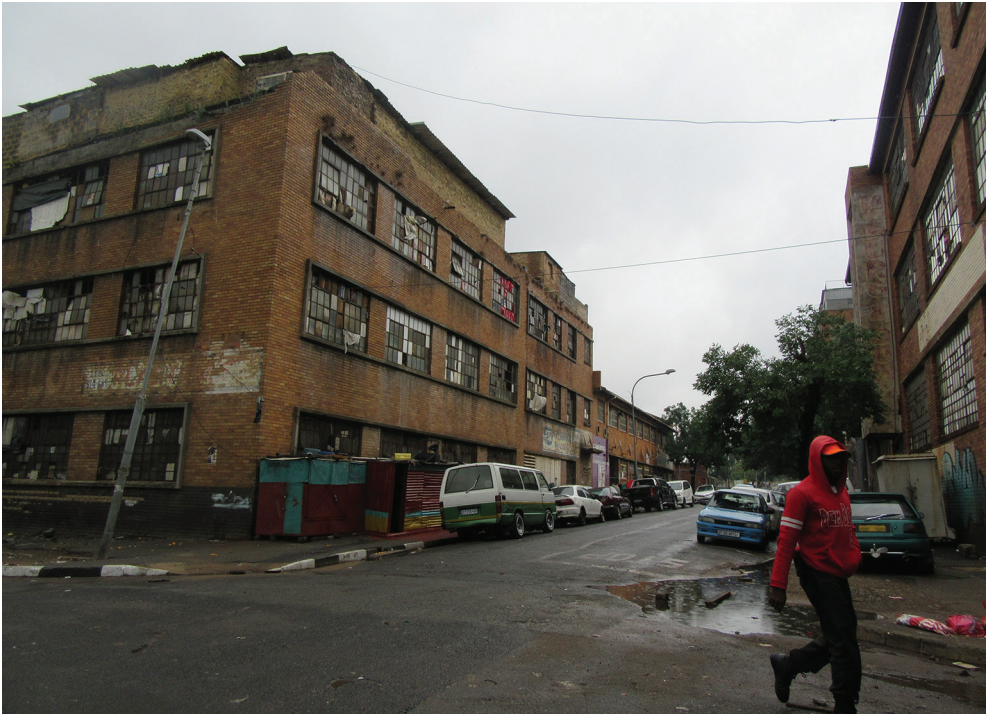
Figure 8. A 1950s factory building on the corner of Hanau and Janie Streets, Jeppestown. The structure shows many signs of being a hijacked building, notably spectacular neglect. Shacks have been built on the roof.