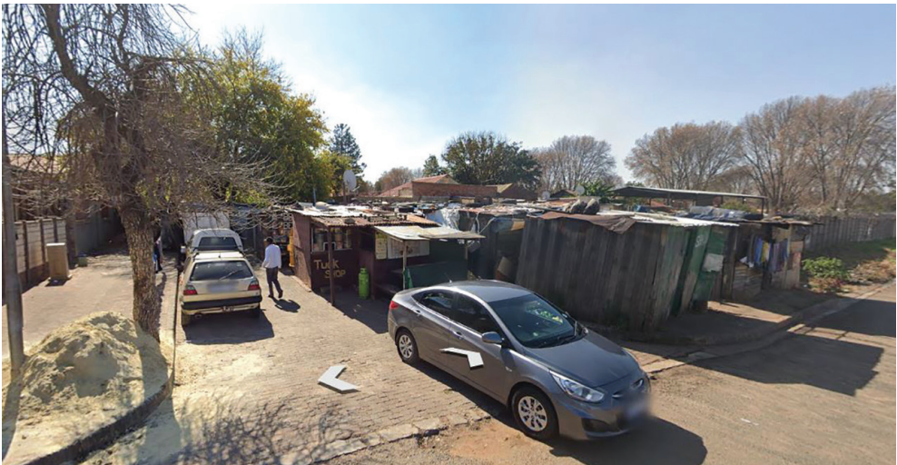
Figure 9. An illegal shack settlement on a suburban road, Concession Street in Jeppestown, north of the railway line.