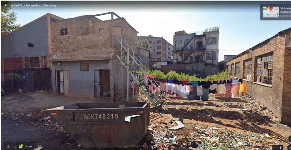
Figure 5. Here to stay: permanent, upper-storey addition in Karl Street near the Wolhuter Men's Hostel. The addition is likely to have no building approval but is not hidden, indicating a lack of municipal oversight.