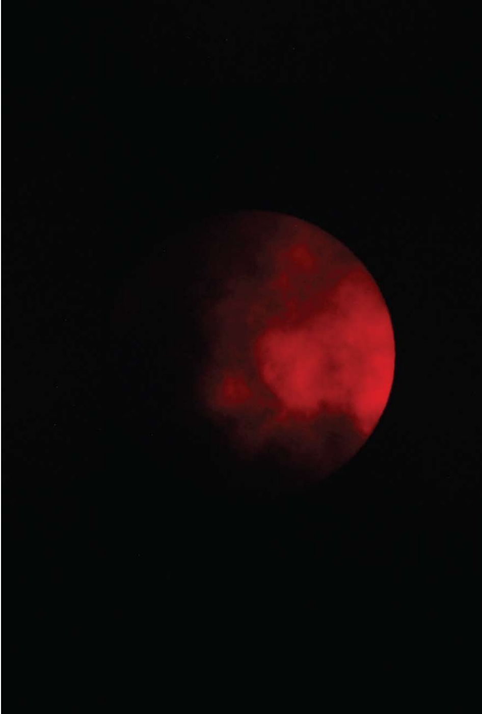
Figure 6. Hydrogen Alpha Cloud (2008), photograph by David Haines. Reproduced courtesy the artists and BREINSPACE, Sydney.