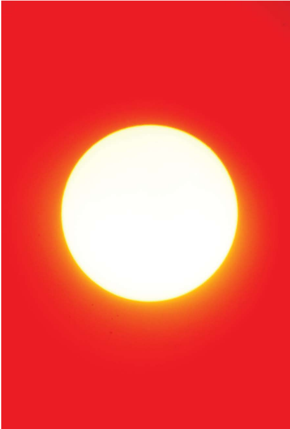
Figure 5. Hydrogen Alpha White Sun (2008), photograph by David Haines. Reproduced courtesy the artists and BREENSPACE, Sydney.