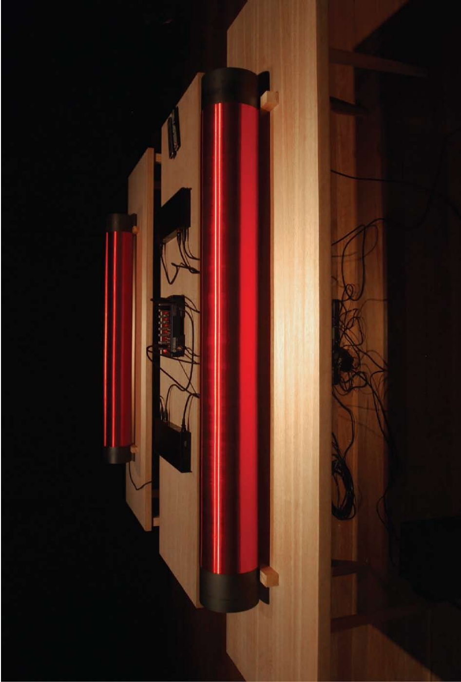
Figure 4. Installation view of EarthStar VLF antennas (2008), photograph by Haines/Hinterding. Reproduced courtesy the artists and BREENSPACE, Sydney.