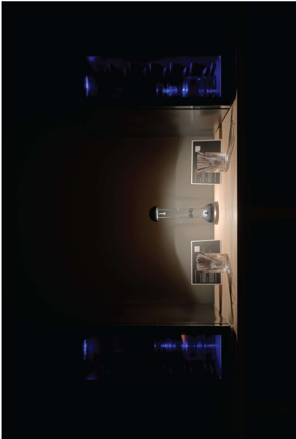
Figure 3. Installation view of EarthStar and molecular compositions (2008), photograph by Michael Myers. Reproduced courtesy the artist and BREENSPACE, Sydney.