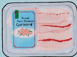
Red Gurnard / Chelidonichthys cuculus