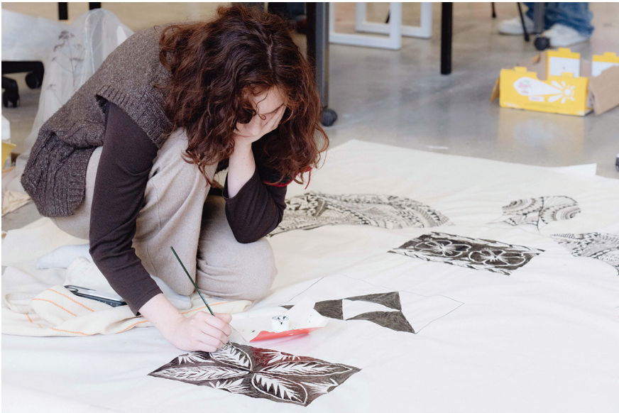
Figure 3. Studio studies, works in progress.

material: fish-and-chip paper. This object, so deeply woven into my family life, carries its own quiet significance. It speaks to shared meals, not just with my immediate family but across the wider aiga (extended family) on Friday nights, birthdays, Sundays, when food wasn't just food, but love passed around a table. In this work, the paper becomes a substitute for tapa backcloth, not in a way that diminishes tradition, but in a way that translates it making space for how diasporic materials can carry similar weight and intention.