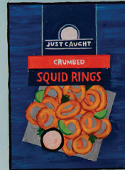
Squid / Illex argenteus