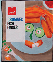
Cod / Gadus morhua