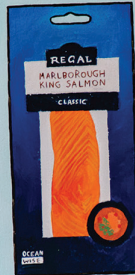
Salmon / Oncorhynchus tshawytscha