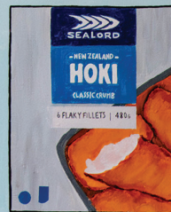
Hoki / Macrurus novaezealandiae