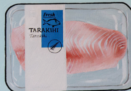
Tarakihi / Nemadactylus macropterus