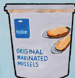
Mussel / Perna canaliculus