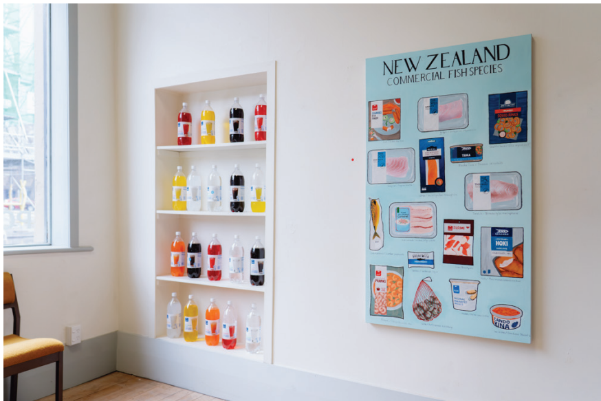
Figures 2 and 2a. Isabella Lepoamo, New Zealand Commercial Fish Species .

Pop Art wasn't just a clever aesthetic. Warhol understood that what's popular, what's mass-produced, is what surrounds us, feeds us and shapes how we see ourselves. That immediacy and specificity—the refusal of narrative—is what made his work so sharp. He turned the everyday into serious cultural currency.