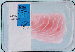
Snapper / Pagrus auratus