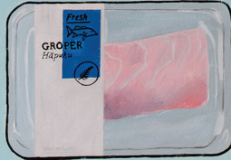
groper / polypterus argenteus