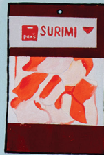
Crab / Brachyura