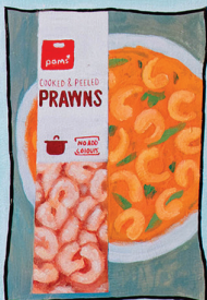
Prawn / Decapod crustacea