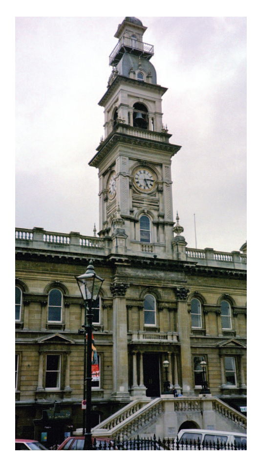
Figure 3. Town Hall at the Octagon in Dunedin, Photo contributed by DLiebisch on de.wikipedia.

the balcony by reading the transcribed text of his measuring from the previous ninety minutes. The donut time and data. Chewed but flowing.