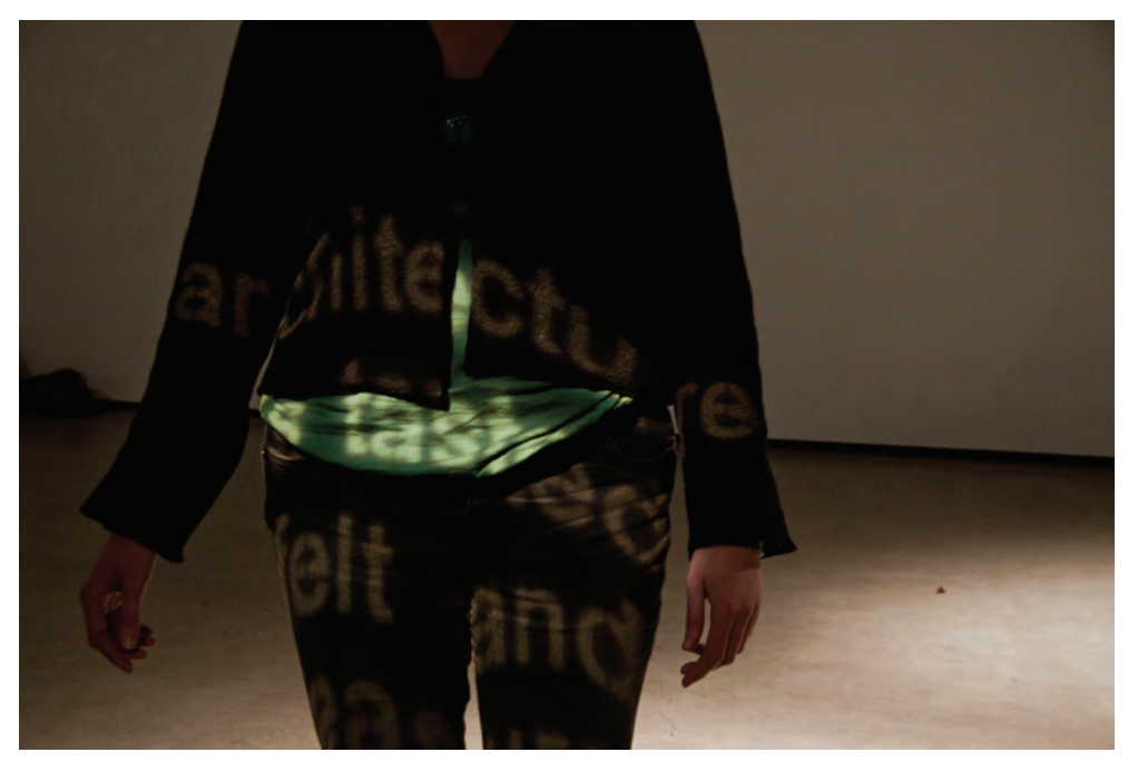
Figure 6. col Fay, [Sur] face (2011), detail showing text written on the body through liminal qualities explored through light.

This duality posits a tension on the surface of the body. As the body moves through space, light provides the surface of readability and works as a transitional zone or membrane, an interface between the object and the subject. As a consequence, the body is marked by this socially constructed effect; it is constrained by the conventions of the language within which it appears. In this sense, the body may not appear to be a free expression of "self," but rather a constructed expression constrained to perform in the social context in which it finds itself. The skin that has been inscribed is both connected and separated from the body by means of decoration, an ornamental staining contained within the purified space of the gallery.