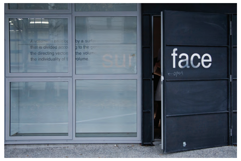
Figure 5. col Fay, [Sur] face (2011). Exhibition entry via public carpark.

Conceptually, the architectural envelope of the exterior is articulated as a porous membrane that promotes fluidity between the body and the environment. The façade, the outermost layer of a building, poses as a mask and performs a reflective articulation of an interior state, or disguises it. This positions the facade within a relationship between external and internal spaces.