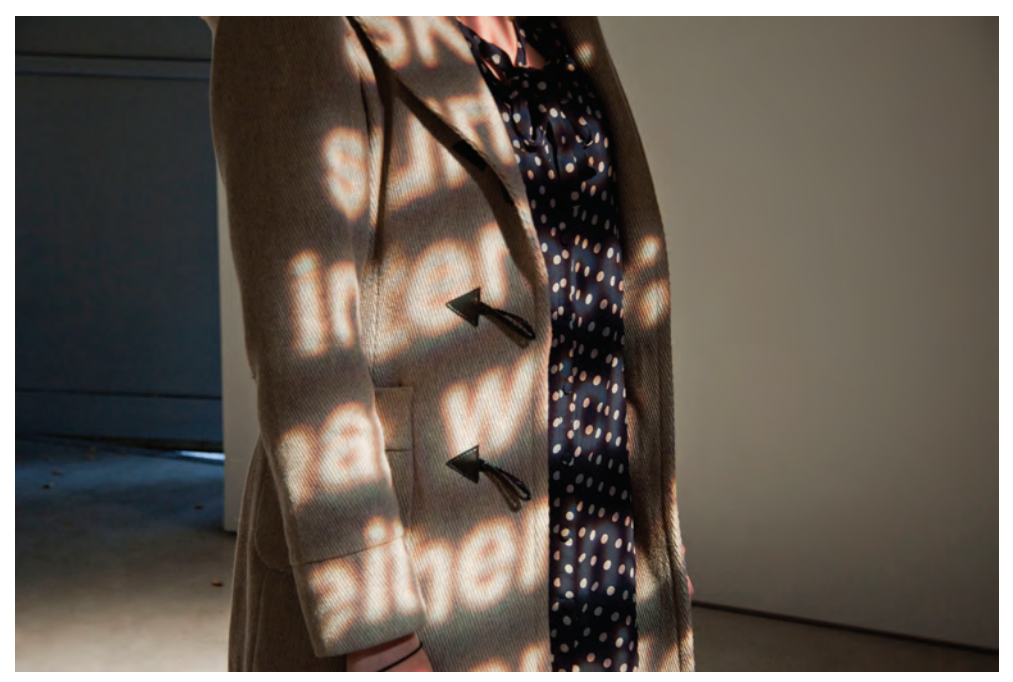
Figure 2. col Fay, [Sur] face (2011), detail of hidden text meeting body.

visibility of the social body while masking the physical body of the gallery space; the artwork, and in this case the body, becomes decorative, ornamentally staining the pure surface of the gallery wall and confusing the form.