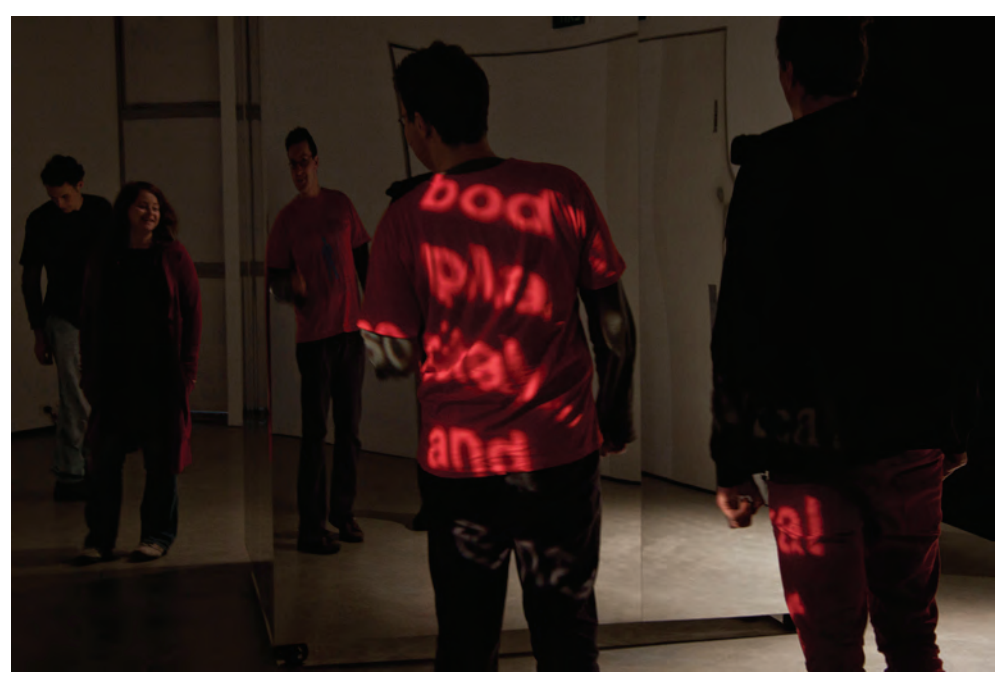
Figure 3. col Fay, [Sur] face (2011), detail exploring consciousness of seeing and been seen.