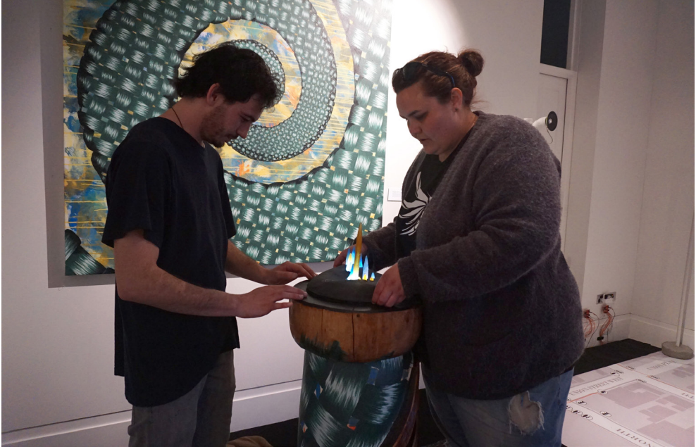
Figure 8. Installing the work for the Art and Space Exhibition.