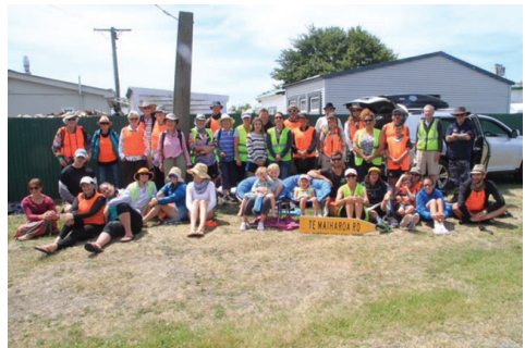
Figure 6. Te Heke ki Korotuaheka 2016.

Approximately fifty whānau members joined Te Heke o Ōmāramataka, which comes from the Māori concept Ō mā hā ra ta ngā, derived as the ancient sounds from another nation, in another time, the dream time, the memory time, the time of many suns shining. 25 The whānau journals documented the experiences of whānau participants as they walked up the Waitaki Valley from 27th – 31st of December 2012. A hue (gourd) was especially created to carry some of the sacred water from the mouth of the Waitaki river back up through the Waitaki Valley to one of the Waitaki River sources, the Ahuriri