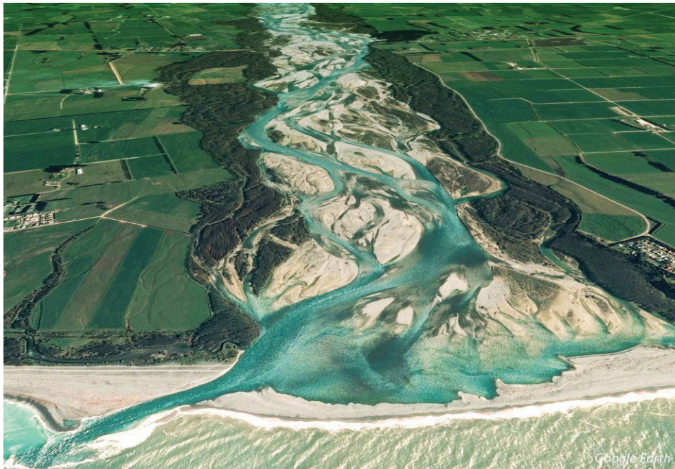
Figure 2. The Waitaki River Mouth.

valley below, to his brother Takaroa, deity of the moana on the East Coast. Karaitiana 8 also recalls a narrative about Aoraki which connects Kirikiri Katata, the ariki (chief) of the Arai-te-uru waka, with the lower summit of Aoraki, to stand where the rakatira reside on the highest peaks of the land.