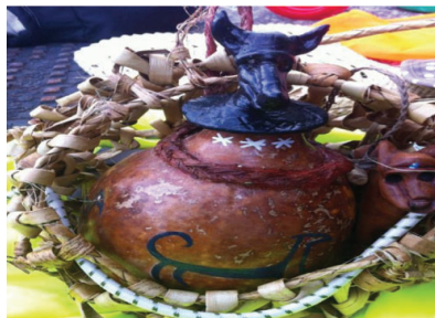
Figure 7. The elaborate hue which carried the sacred Waitaki waters through the Waitaki valley.

The whānau gathered around the ahi tāpu, karakia were said. Next the water from the taha was poured into the ipu for the night stars to dance upon, karakia were woven into the waters followed by waiata. I was very fatigued following the creative build up by this stage and did not sleep well this night. (from whānau journal – participant E).