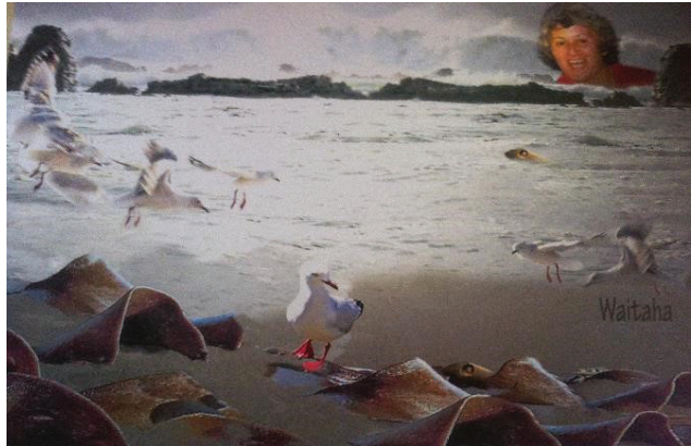
Figure 4. Montage of Anne Sissie Pate Titaha Te Maihāroa-Dodds by Ramonda Te Maihāroa. Private collection Anne Te Maihāroa-Dodds.

peaceful protest of protection for the Waitaki river and set a clear kawa that protest banners would not be welcomed. This peaceful march represented protection, rather than a demonstrated protest.