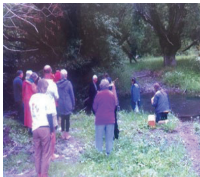
Figure 10. The end of the closing ceremony, where the water carried from the mouth of the Waitaki River was returned to the Ahuriru Stream, Ōmārama. 30th December 2012.