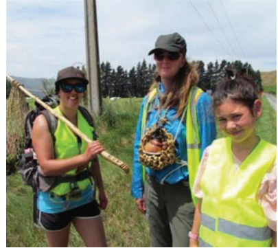
Figure 9. Carrying the sacred waters from the Waitaki River mouth back to the Ahuriru River during a heke to remember their ancestor Te Maihāroa. 28th December 2012. 26

I'm really recognising what a special pilgrimage / journey that we are all on – the carrying of the waters and the fire: the wind helping to move us along the way (the winds of change?) and the connection of feet to earth and treading softly – reconnecting to our earth mother – was so profound (from whānau journal – participant C).